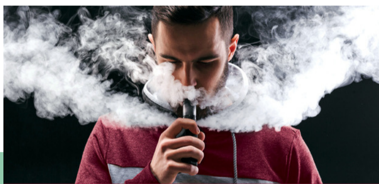
Vaping 101: What's Important to Know

OCTOBER 27, 2020 7:00 PRESENTED VIRTUALLY IN COLLABORATION WITH SRSly MANCHESTER