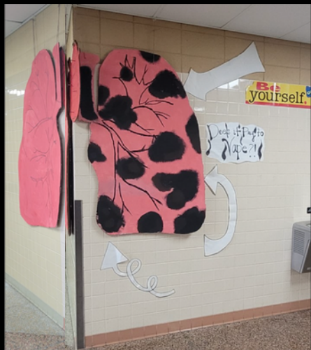
Summerfield High School Created a large lung to raise awareness on the health risks associated with vaping.

Monroe County Student Prevention Leadership Teams run an Annual Vaping/Nicotine Initiative to educate their peers about the dangers of Vaping and Nicotine