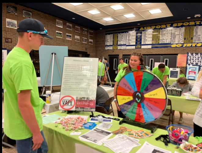
Airport High School Educating on the dangers of vaping.

96% Monroe County High School and Middle School Students surveyed acknowledged that vape juice & e-liquids contain several toxic & dangerous chemicals that can make them sick.