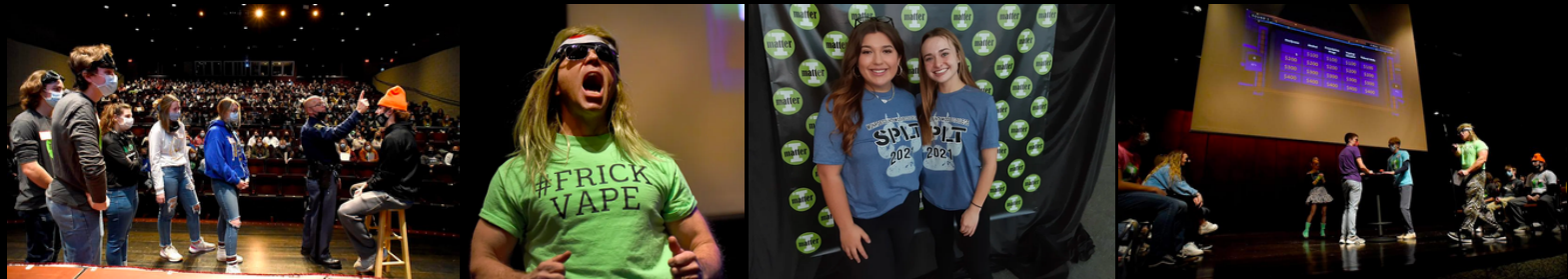
Pictures from the Monroe County #IMatter Youth Summit, which focuses on substance misuse prevention and mental health awareness and wellness