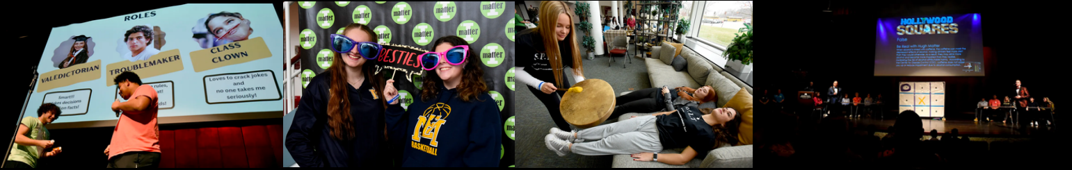
Pictures from the Monroe County #IMatter Youth Summit, which focuses on substance misuse prevention and mental health awareness and wellness